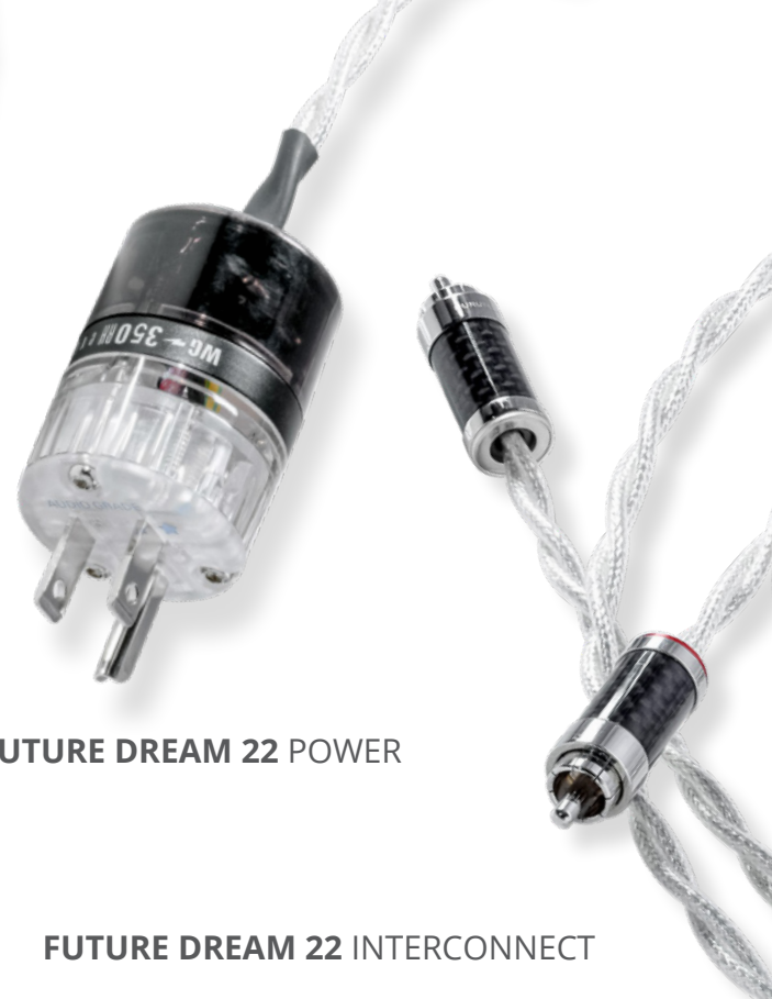
FUTURE DREAM 22 POWER