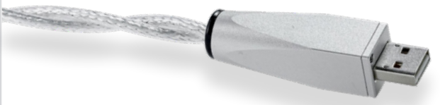
FUTURE DREAM 22 USB