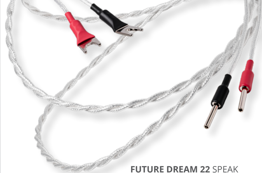
FUTURE DREAM 22 SPEAK